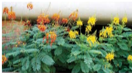
Red Birds and Vegas Birds of Paradise

If you're looking to add some desert color to your landscape this summer, here's some candidates for you! Their lacy, tropical and ferny leaves are heavily accented by wonderfully colorful flowers. Their common name, "The Bird of Paradise", is quite appropriate.