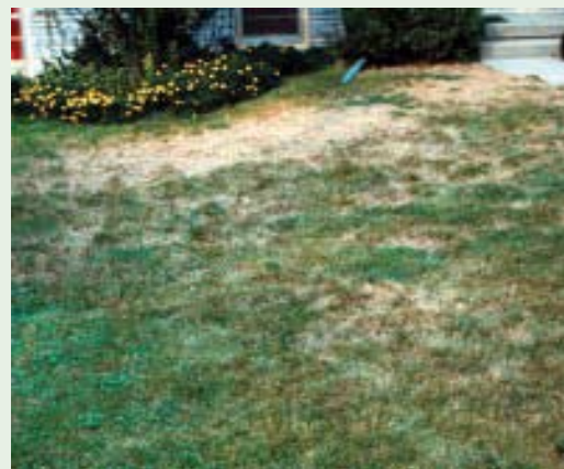
Summer Lawn Stress

Resist the temptation to water everything to death in the heat. Watering established shrubs and trees deeply and infrequently – about 3 times a week – and using surface mulches will keep your plants healthy through this stressful time.