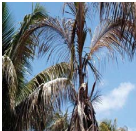
Cold Damaged Palm

The most important and the most vulnerable part of the palm tree is the terminal bud, located in the very top center of the tree. The bud is where new leaves emerge. Protection of this bud from severe cold is critical to keep the palm healthy. If the bud tissue of the palm has NOT been severely damaged, the palm should recover and start producing new leaves during the following summer. If the bud tissue has been severely damaged, the palm might not survive.