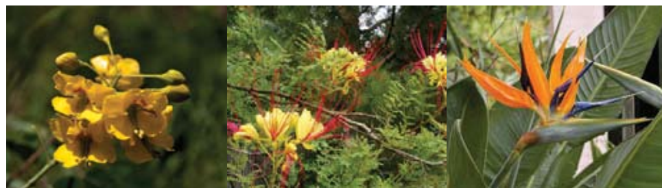
Mexican Bird of Paradise ( Caesalpinia mexicana )

The Caesalpinias provide lovely desert color throughout the hot summer months. And; Yes! You can plant them in full afternoon sun!